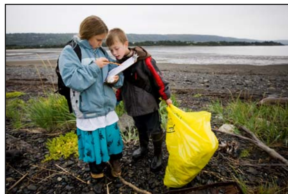
Figure 3. Kachemak Bay CoastWalk has offered long-standing educational opportunities for youth and adults to learn about the health of local coastal habitats. Over 400 volunteers conducted marine debris surveys in 2009.